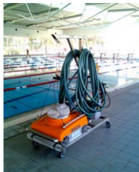
^ WEDA B680

After months of research, the AIS has chosen to use the WEDA B680 for use in cleaning all their pools, including their new $17million pool, billed as one of the most technologically advanced pools in the world